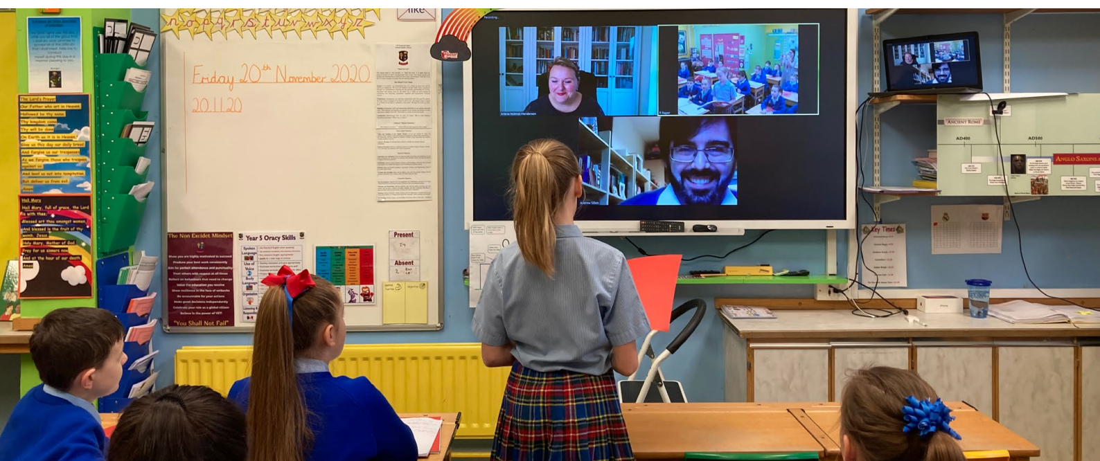
ORACY ZOOM LESSON AT ST FRANCIS DE SALES CATHOLIC JUNIOR SCHOOL