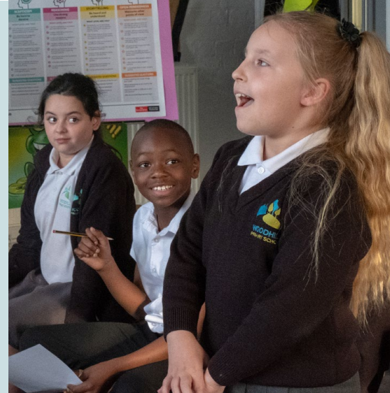
THE ECONOMIST EDUCATIONAL FOUNDATION'S BURNET NEWS CLUB PROGRAMME (WOODHILL PRIMARY SCHOOL)

I am personally hugely grateful to the enormous range of people who have contributed so far to our Inquiry. We have heard from teachers and other practitioners working with children, employers, academics, organisations supporting oracy and parents. But perhaps most importantly, we have heard from lots of young people. It is not often – particularly in this day and age – that you find something about which so many people agree. Virtually everyone contributing to our Inquiry believes that oracy should have a higher status or even equal status to reading and writing within the education system.