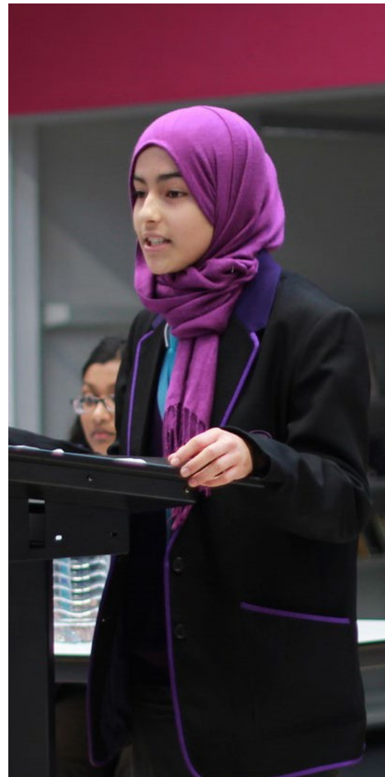
VOICE 21 (SCHOOL 21)