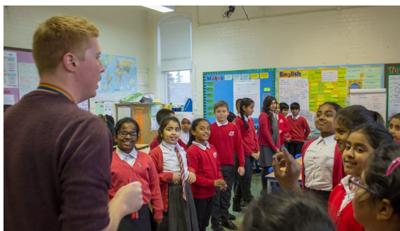
THE ECONOMIST EDUCATIONAL FOUNDATION'S BURNET NEWS CLUB PROGRAMME AT NEWBURY PARK PRIMARY SCHOOL